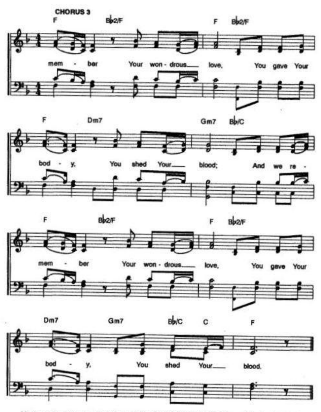
Mediey options: Come to the Table; By Your Blood; Blessed Be the Name of the Lord (MOEN).

© 1991 Integrity's Hosanna! Music. c/o Integrity Music, Inc., P.O. Box 16813, Mobile, AL, 36695. All rights reserved. International copyright secured. CCLI Song # 451177 Used with permission through our Christian Copyright License Incorporated License Number 706121 and Christian Copyright License Incorporated Streaming Plus License 21787152.